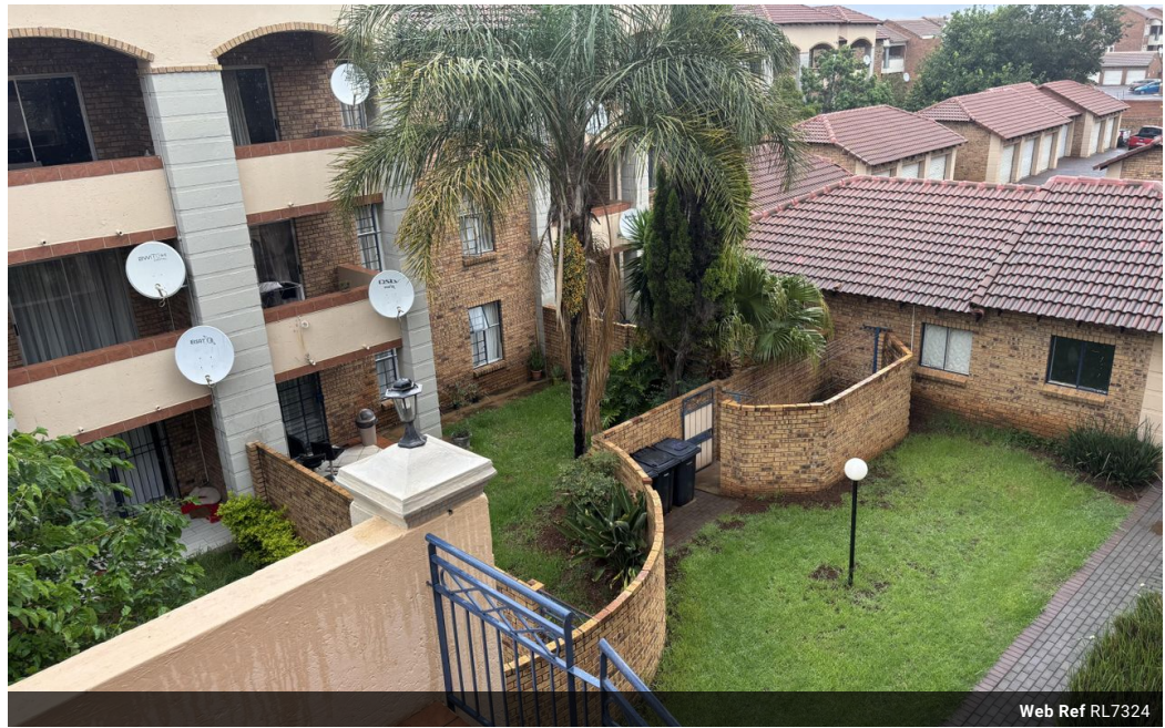
Web Ref RL7324

Oak Avenue Office Park 376 Oak Avenue Ferndale Randburg 2194