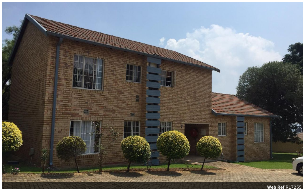
Web Ref RL7255

Oak Avenue Office Park 376 Oak Avenue Ferndale Randburg 2194