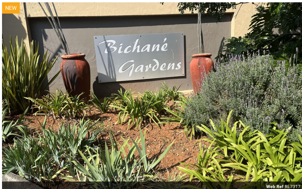
Web Ref RL7317

Oak Avenue Office Park 376 Oak Avenue Ferndale Randburg 2194