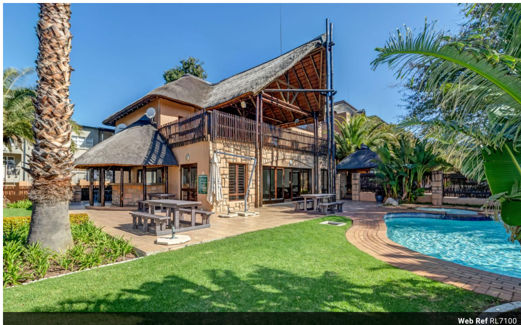
Web Ref RL7100

Oak Avenue Office Park 376 Oak Avenue Ferndale Randburg 2194