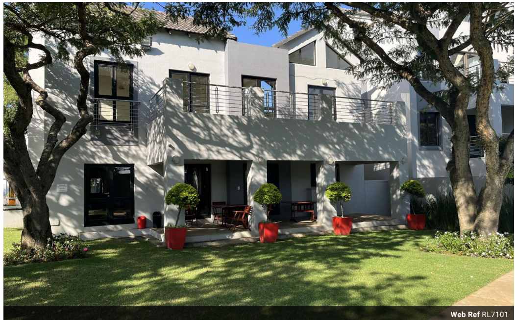
Web Ref RL7101

Oak Avenue Office Park 376 Oak Avenue Ferndale Randburg 2194