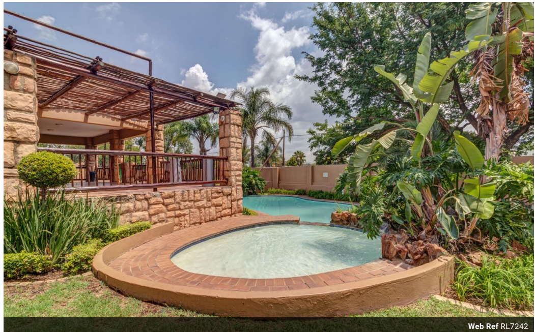
Web Ref RL7242

Oak Avenue Office Park 376 Oak Avenue Ferndale Randburg 2194