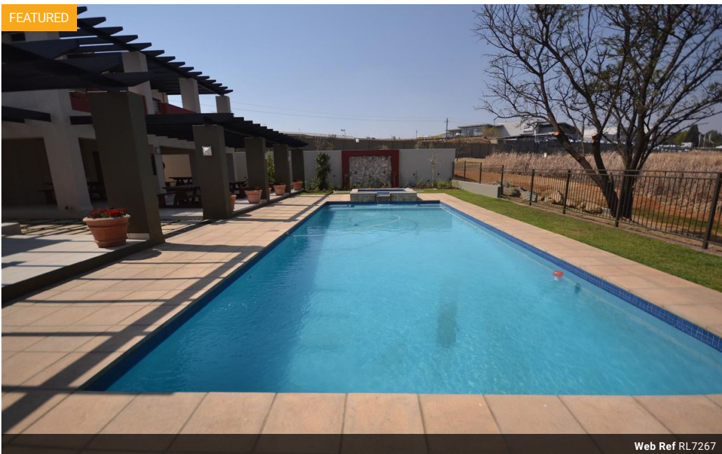
Web Ref RL7267