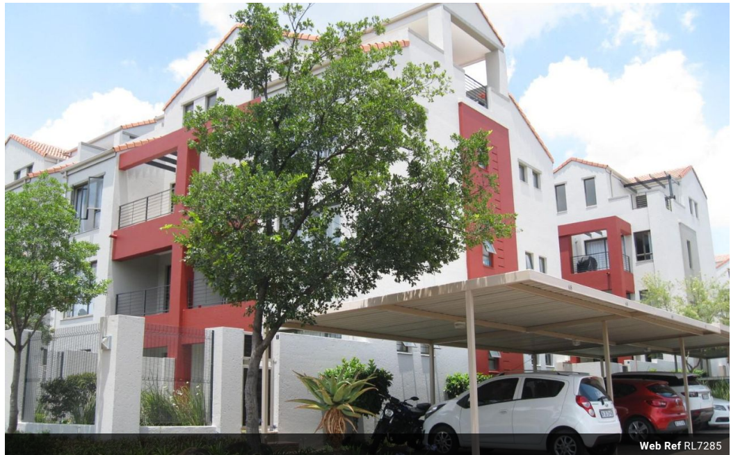
Web Ref RL7285

Oak Avenue Office Park 376 Oak Avenue Ferndale Randburg 2194