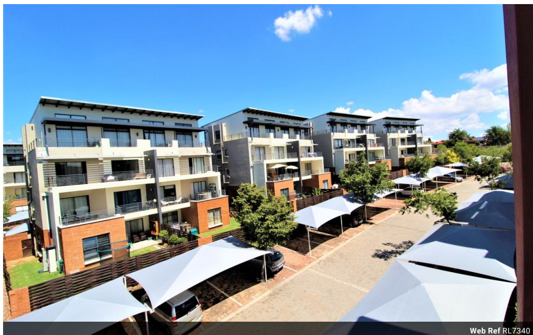
Web Ref RL7340

Oak Avenue Office Park 376 Oak Avenue Ferndale Randburg 2194