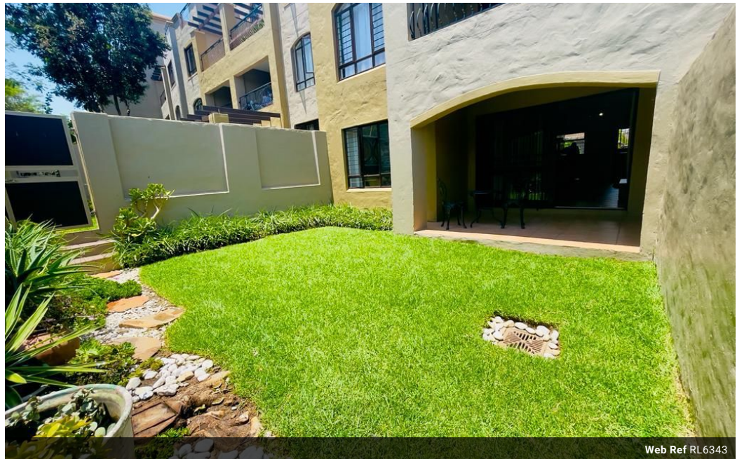
Web Ref RL6343

Oak Avenue Office Park 376 Oak Avenue Ferndale Randburg 2194