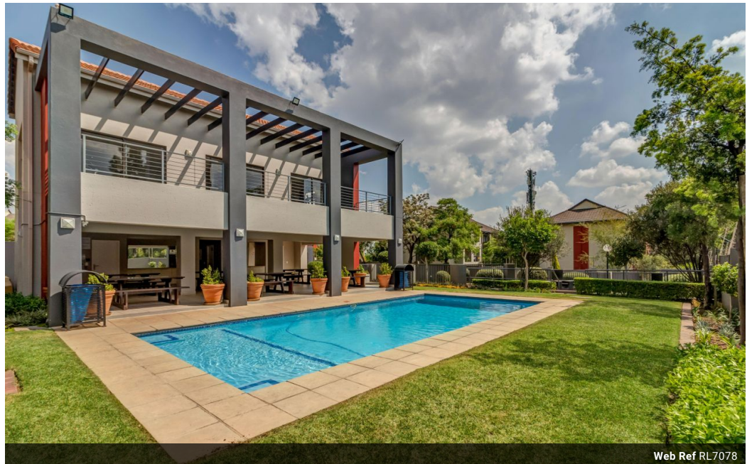
Web Ref RL7078

Oak Avenue Office Park 376 Oak Avenue Ferndale Randburg 2194