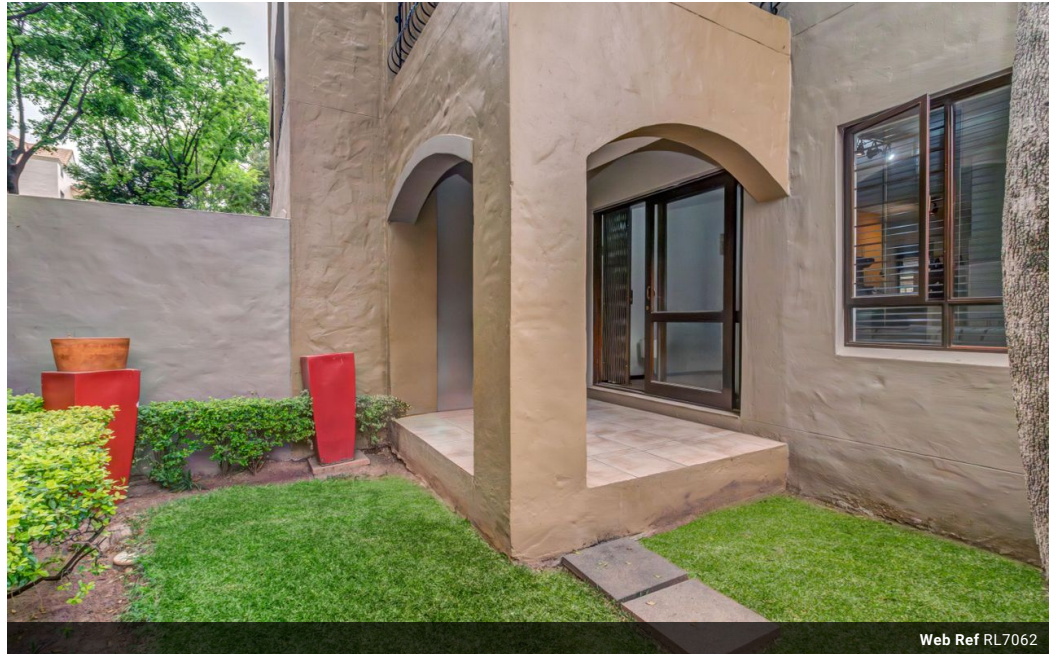
Web Ref RL7062

Oak Avenue Office Park 376 Oak Avenue Ferndale Randburg 2194