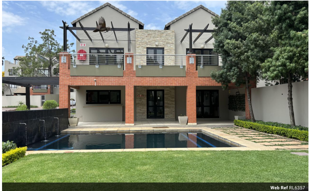
Web Ref RL6357

Oak Avenue Office Park 376 Oak Avenue Ferndale Randburg 2194