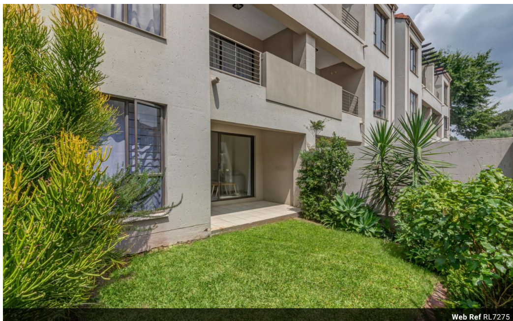
Web Ref RL7275

Oak Avenue Office Park 376 Oak Avenue Ferndale Randburg 2194