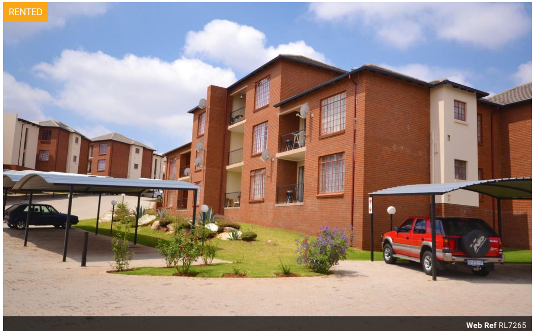
Web Ref RL7265