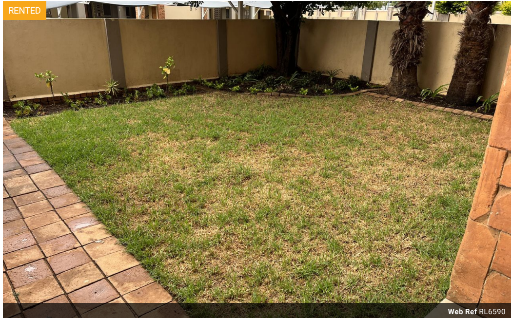
Web Ref RL6590

Oak Avenue Office Park 376 Oak Avenue Ferndale Randburg 2194