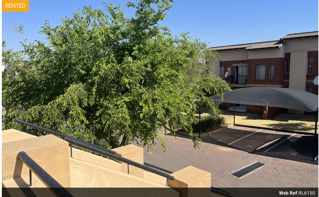
Web Ref RL6150

Oak Avenue Office Park 376 Oak Avenue Ferndale Randburg 2194