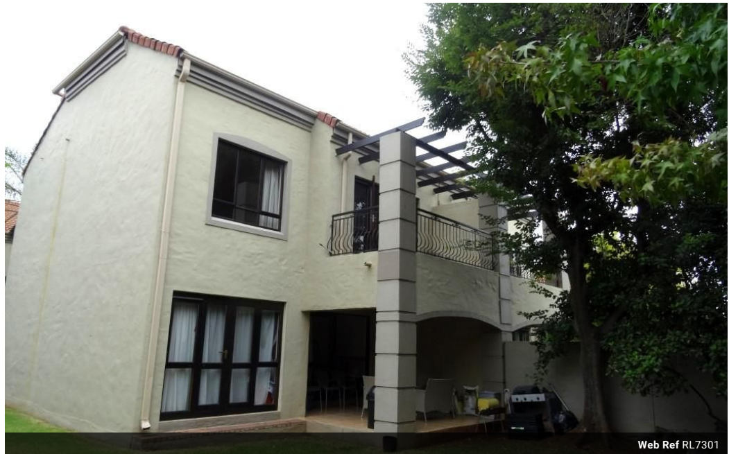
Web Ref RL7301

Oak Avenue Office Park 376 Oak Avenue Ferndale Randburg 2194