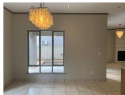
Web Ref RL7333